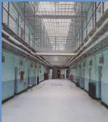
Shepton Mallet Prison