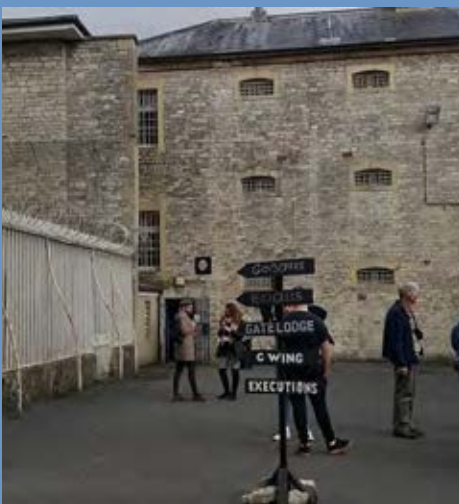
Shepton Mallet Prison