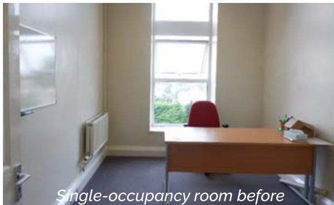
Single-occupancy room before