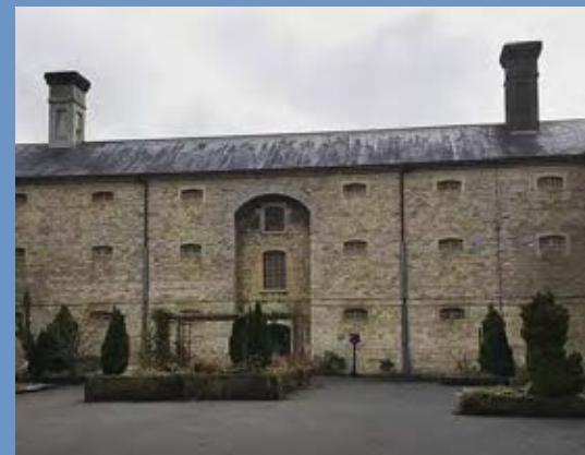
Shepton Mallet Prison